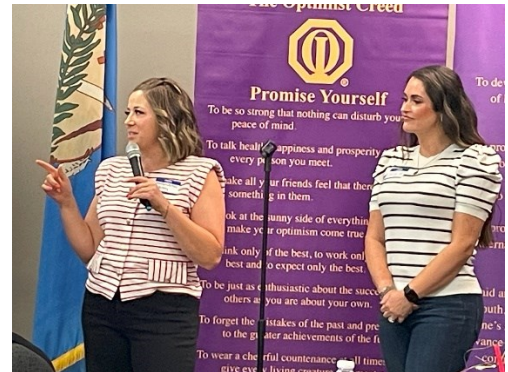
BIXBY OPTIMIST CLUB OFFICERS