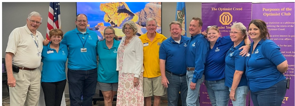
Past NTX, Oklahoma, and TexHoma District Governors