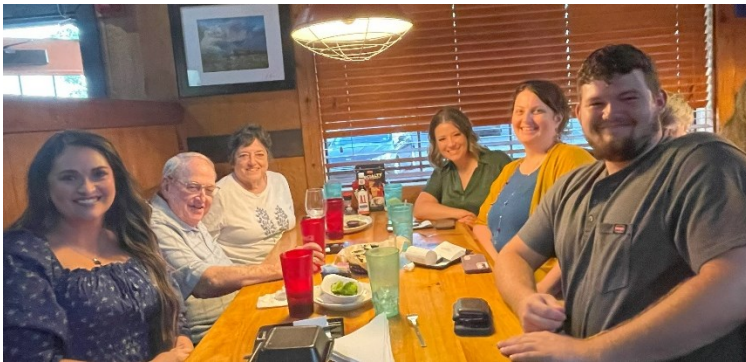
FRIDAY NIGHT DINNER at SANTA FE CATTLE COMPANY