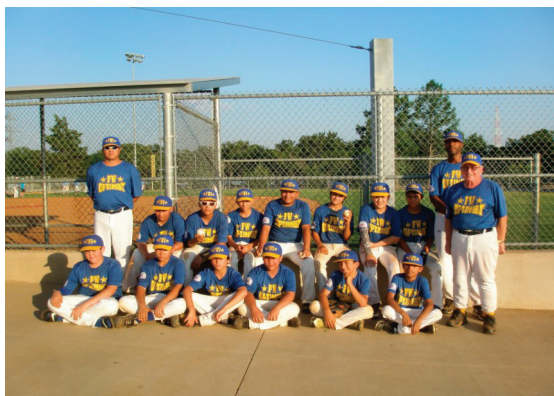
Optimist Mustang All-Stars at a PONY League Zone Tournament.

The Optimist Club of Fort Worth strongly believes in sports programs for children. Research on youth participation in sport and physical activity has demonstrated that it is one of the most effective means of combating childhood obesity, in addition to helping kids avoid risky behaviors and achieve greater self-esteem and academic success.