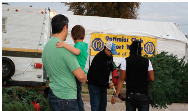
Christmas Tree Sales

To accomplish all of this takes funding, most of which is raised through a 65 year tradition of selling Christmas trees at Farrington Field (corner of University & Lancaster). Optimist Christmas Trees have become a Fort Worth institution and tradition for multiple generations of city residents.