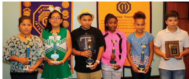
Outstanding Junior Optimists