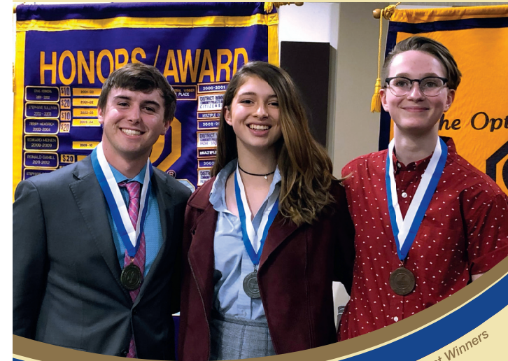
Essay Contest Winners